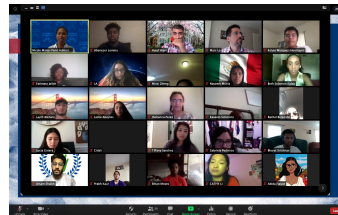
OVOC Experience & Satisfaction Rating