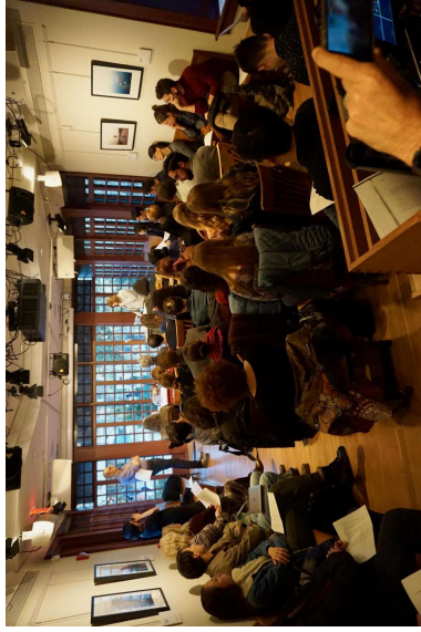
A crowd gathers for a poetry reading at the Kelly Writers House during the 2019 YLME symposium. Images such as this were added to the website, with captions in Russian and English, during the project.